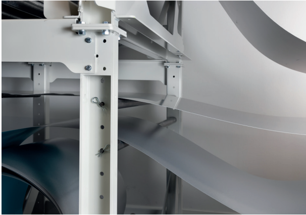
The guide rollers are movable in height, lifts up the sheet and create distance so that you avoid scratches in the lacquer layer.