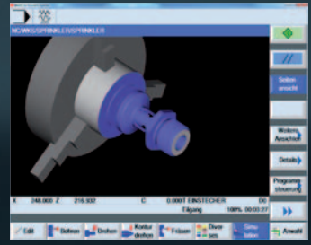
Simulation suitable for training using Win3D-View