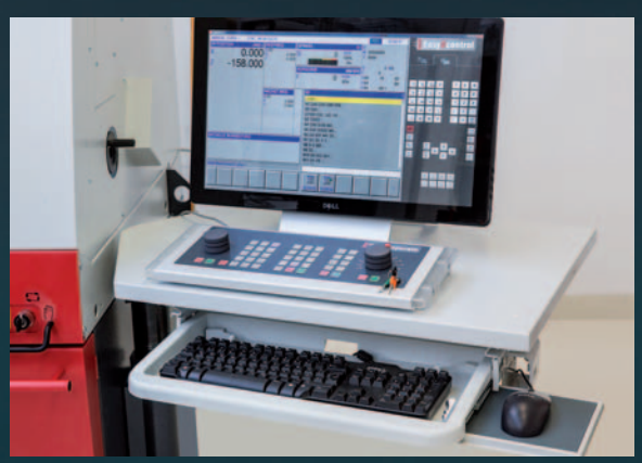
Easy2control with Easy2operate

To operate the software on the Concept machine a license dongle and a small machine control panel - "Easy2operate" – is required.