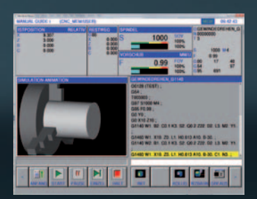
Simple to program using the EMCO WinNC control units